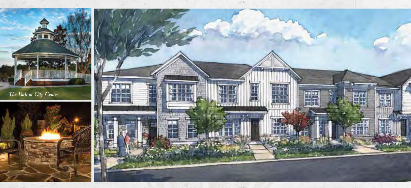
With an intentional focus on picturesque landscaping, tranquil green spaces abound – from Ruisseau's central mew to its pocket park.

French for "stream," Windsong Properties' Ruisseau calls to mind images of a charming French village. Gently nestled around Rubes Creek, it coexists peacefully with the natural world – creating a delightful parklike experience with the city of Woodstock.